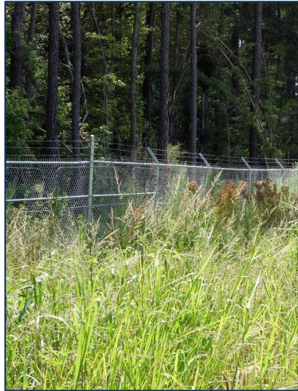
Bushes and trees should be trimmed so that they do not come into contact with the fence and/or sensor.