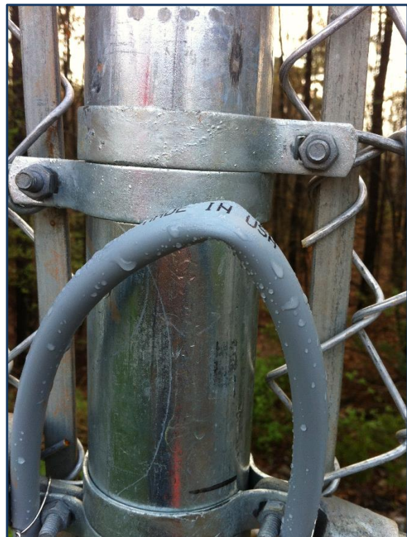
Conduit kinked when exceeding the minimum bend radius.