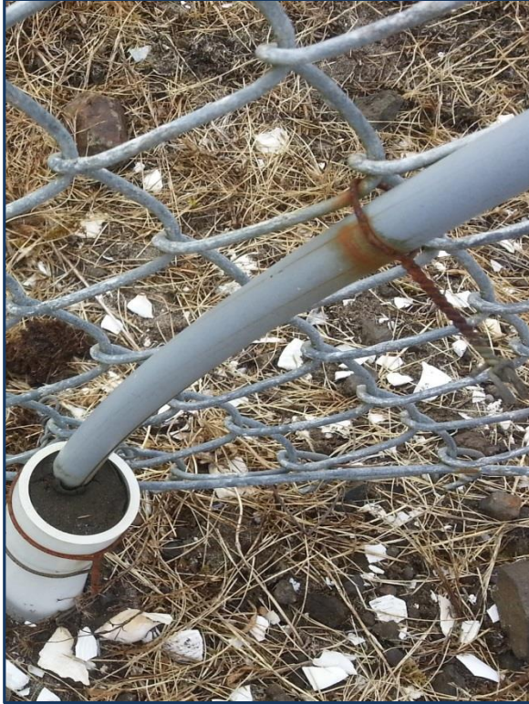
Rusty, damaged, or missing wire ties should be replaced.