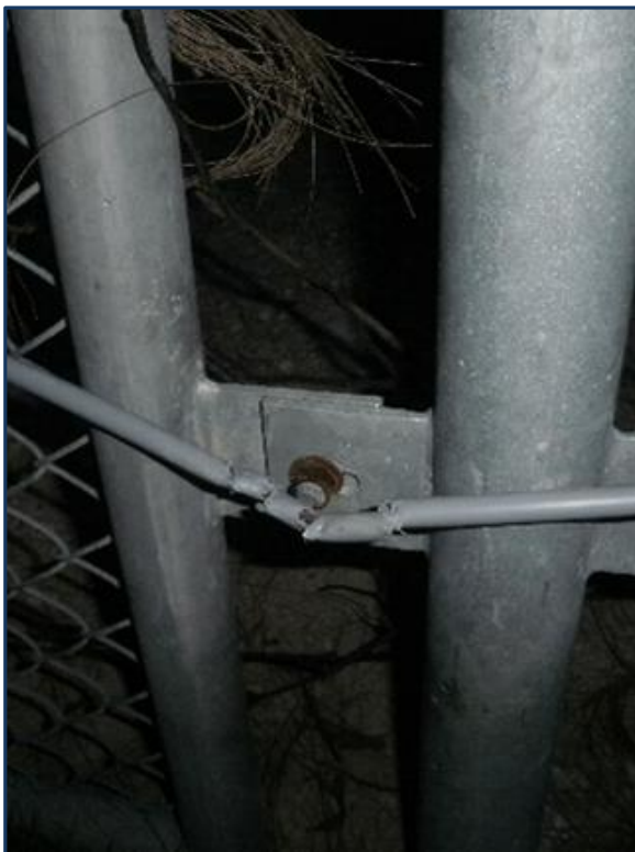
Wildlife damage can occur in areas where cables are mounted low to the ground.

The first step in preventive maintenance is a visual inspection of the installed sensor system. The on-site security and maintenance personnel should be familiar with the system and take notice if anything appears out of order. Fiber SenSys recommends performing a thorough inspection approximately every 90 days. This should include examining each alarm processor, each zone sensor cable and conduit, wire ties, all non-sensing lead-in cables, patch cords, tamper switches, relay wiring, power supply, and backup battery. In addition to inspecting the equipment, the area around the perimeter should be inspected for vegetation that may be in contact with the fence material. Below are images of possible issues that would need to be addressed.