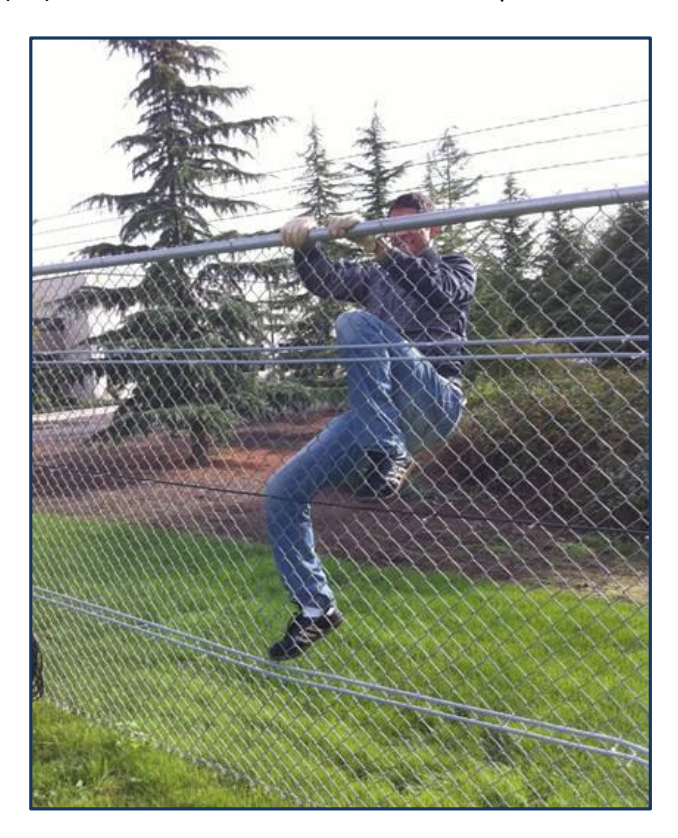
Simulated intrusions should be performed in the same manner as the expected actual intrusions.

Performance testing is a must for maintaining an alarm system that consistently performs at a high level over time. At regular intervals, each zone should be tested to verify that it is capturing intrusions. Zones should be tested in various ways and at multiple locations within the zone. The Probability of Detection (PD) should be calculated based on these performance tests and recorded in a log.