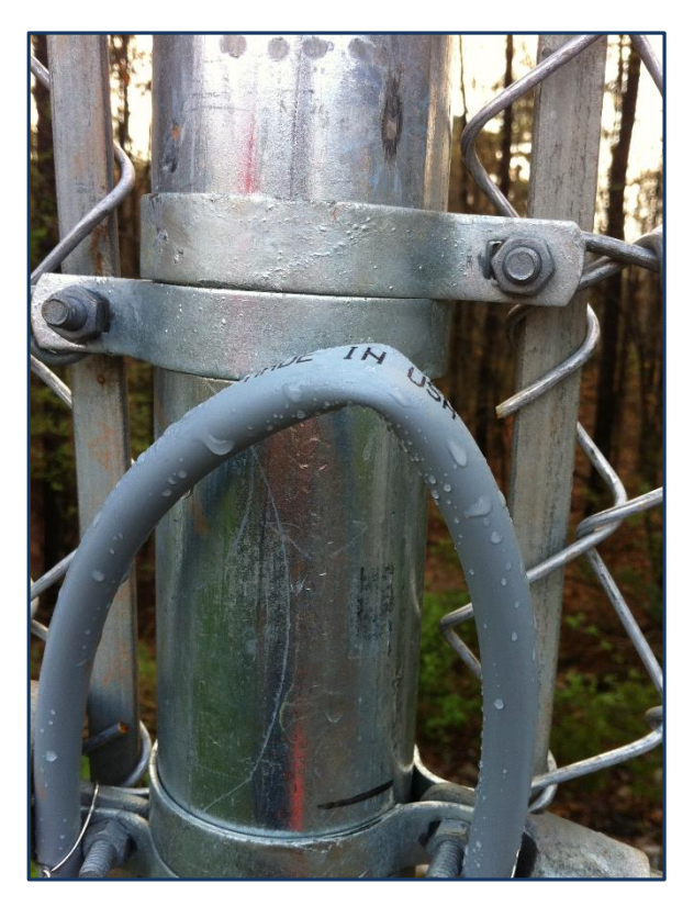
Conduit kinked when exceeding the minimum bend radius.