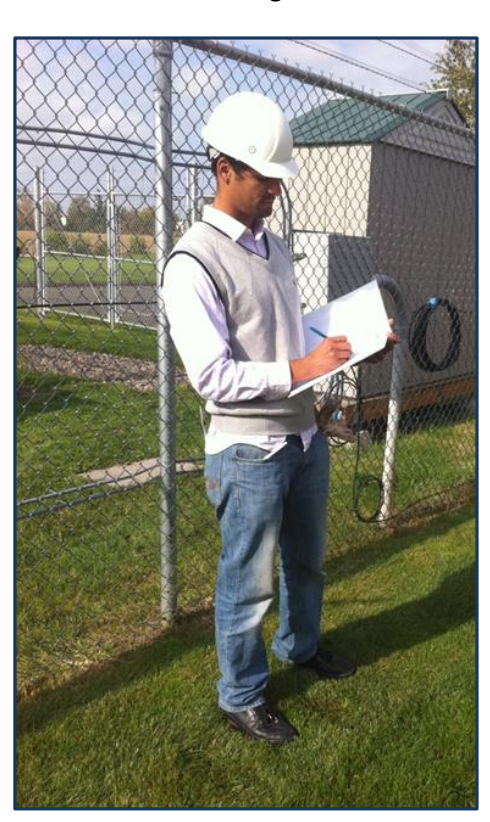
An inspection and test log will help ensure long-term performance and maintain accountability.