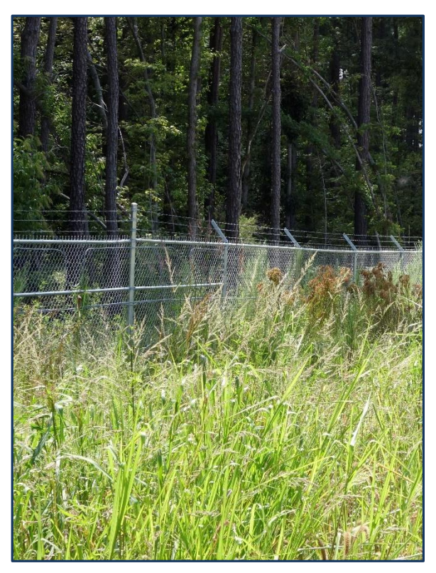
Bushes and trees should be trimmed so that they do not come into contact with the fence and/or sensor.