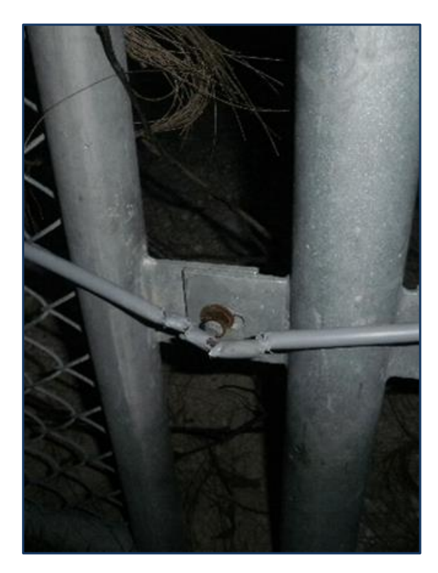
Wildlife damage can occur in areas where cables are mounted low to the around.

The first step in preventive maintenance is a visual inspection of the installed sensor system. The on-site security and maintenance personnel should be familiar with the system and take notice if anything appears out of order. Fiber SenSys recommends performing a thorough inspection approximately every 90 days. This should include examining each alarm processor, each zone sensor cable and conduit, wire ties, all non-sensing lead-in cables, patch cords, tamper switches, relay wiring, power supply, and backup battery. In addition to inspecting the equipment, the area around the perimeter should be inspected for vegetation that may be in contact with the fence material. Below are images of possible issues that would need to be addressed.