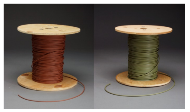
SC-3 sensor cable (left) and SC-4 sensor cable (right)

When connected to a Fiber SenSys Alarm Processing Unit (APU), SC-3 and SC-4 sensor cables detect potential intruders through the use of fiber-optic technology that senses cable movement, interference, or tampering. These proprietary cables are designed to monitor the optical signal properties and detect the effects of movement, vibration and pressure. Together with an APU, these sensor cables form complete intrusion detection systems. The sensor cables are immune to EMI, magnetic fields, radio frequency transmissions and lightning. Rugged, durable construction ensures the cable survives exposure to the elements and weather conditions making them ideal for harsh environments.